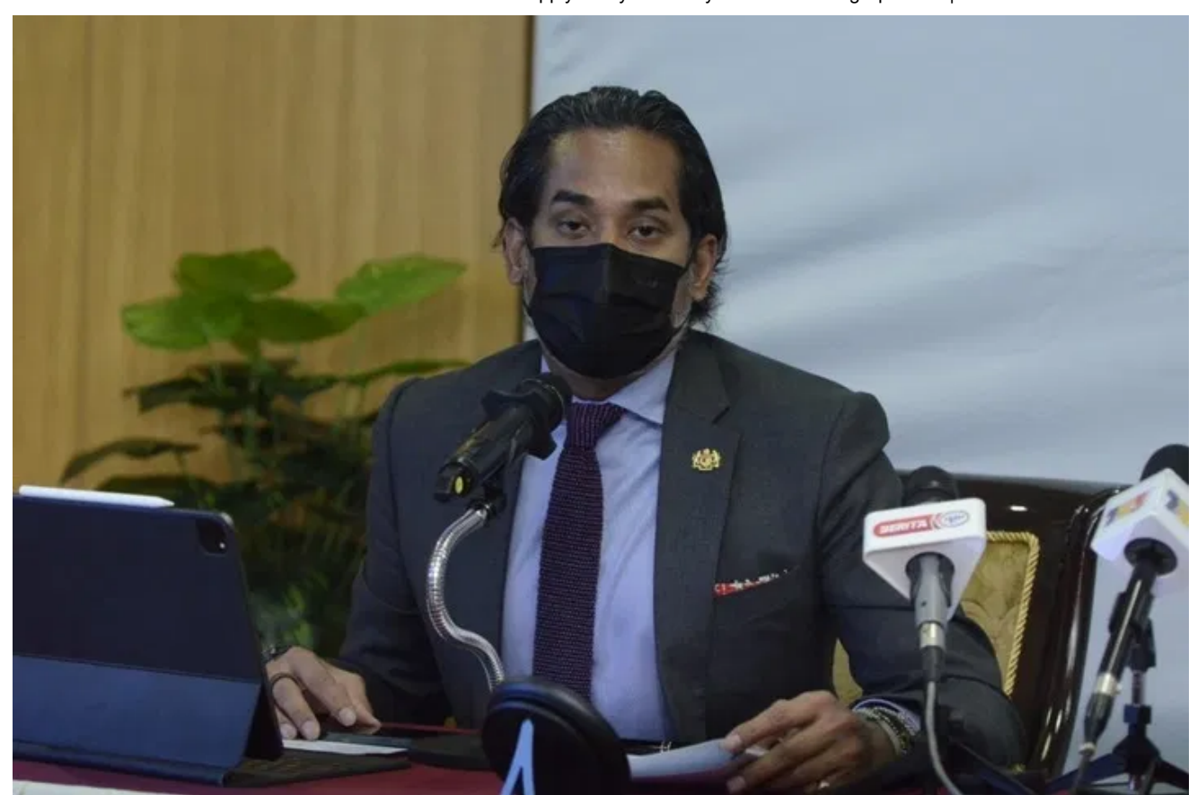
Science, Technology and Innovation Minister Khairy Jamaluddin speaks at a press conference in Putrajaya on April 28, 2021.

KUALA LUMPUR, May 17 — Khairy Jamaluddin today announced that 2.5 million weekly doses of Covid-19 vaccines will be delivered to Malaysia from July onwards, marking a delay in his initial June projection for mass supply.